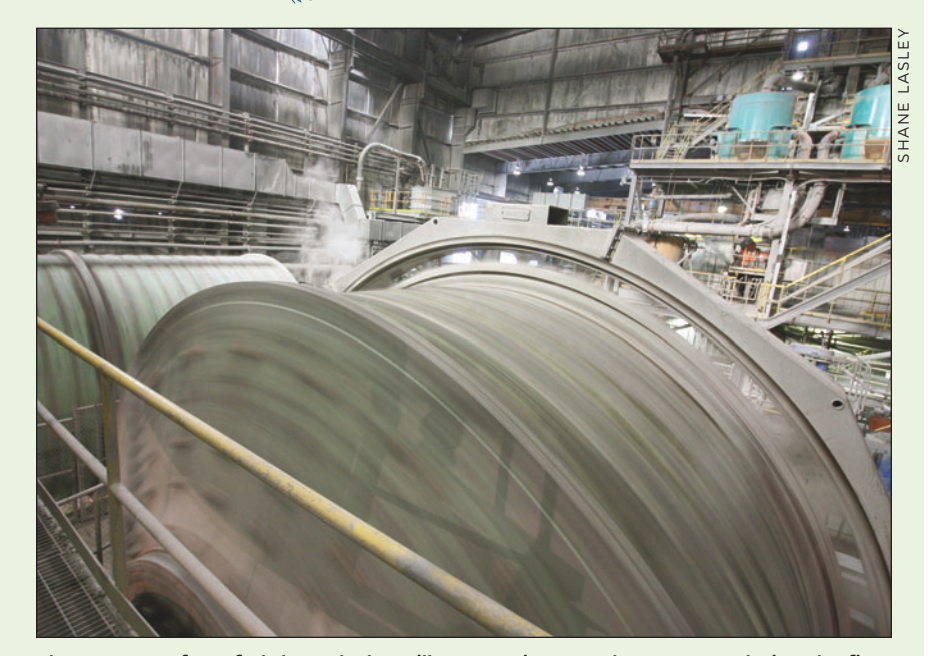
The tonnage of ore fed through the mill at Pogo increased 33 percent during the first three months since Northern Star Resources' acquisition of the high-grade gold mine in