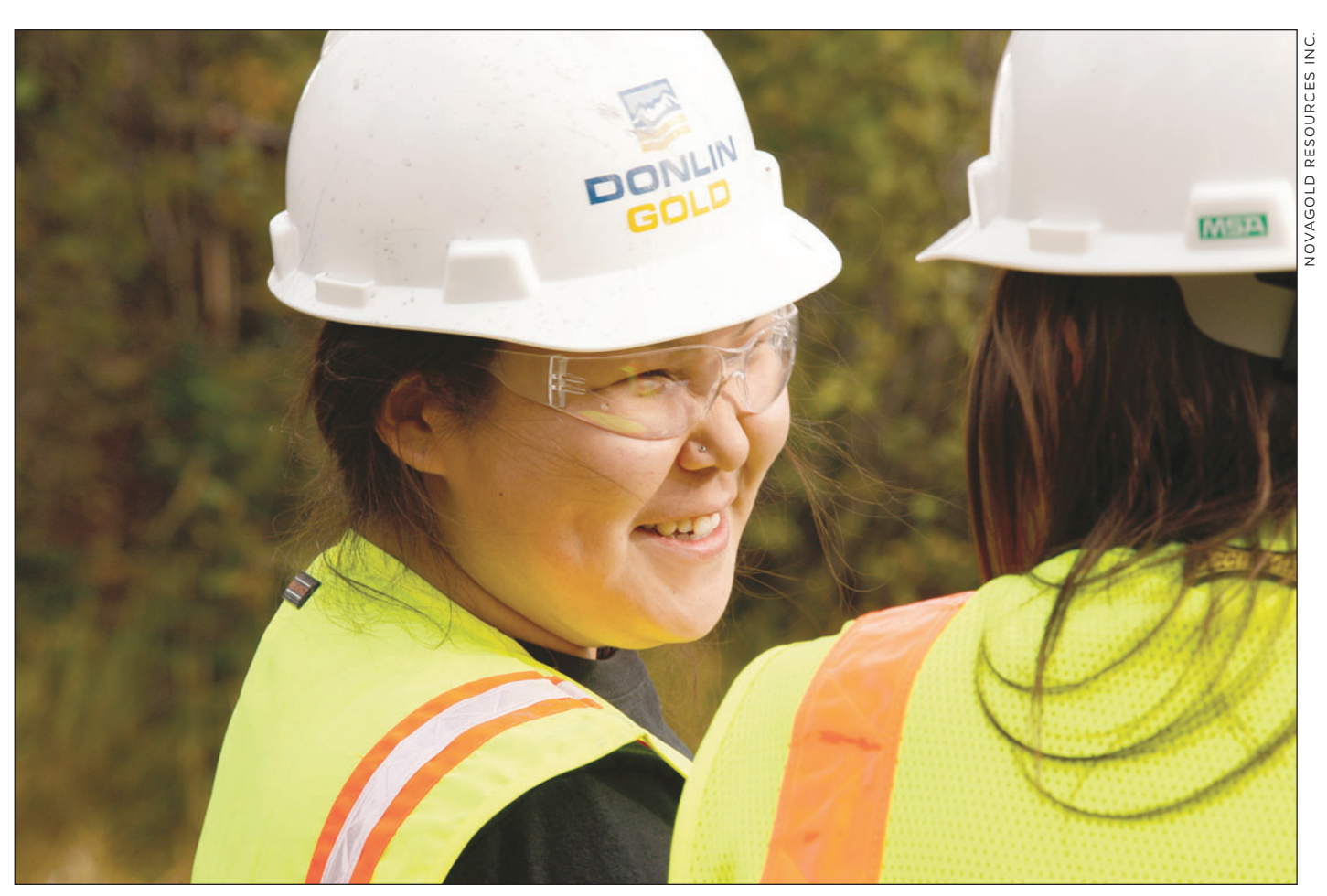
By 2008, nearly 90 percent of the more than 200 workers at the Donlin Gold project in the Yukon-Kuskokwim region of Southwest Alaska were Calista shareholders, or their descendants.

EDITOR'S NOTE: "An Alaska Native claims primer for miners" is the first article in a 13-part series that investigates what the Alaska Native Claims Settlement Act means for Alaska's mining sector and its future. The coming 12 articles will dig deeper into each of the land-holding Regional corporations and the Village corporations within them; the mining lands that they own; and the services they offer to the mining sector. As a life-long Alaskan that has written about mining here for more than a decade, it is my hope that this series will provide a better understanding of ANCSA and serve as a guide to mining companies seeking to do business in The Last Frontier.