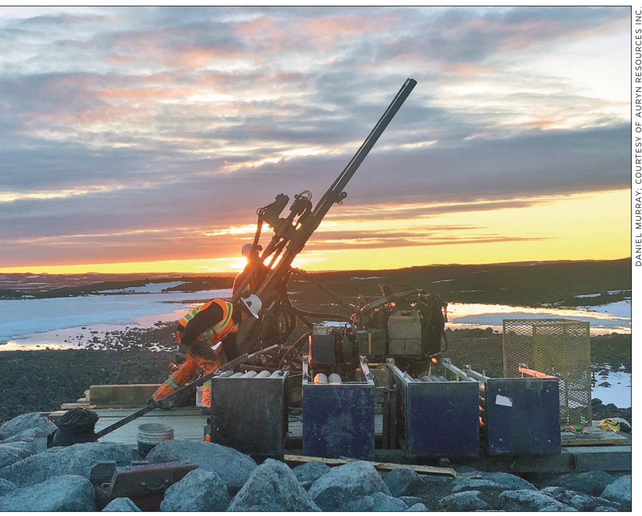
The discovery hole at the Aiviq target on the Committee Bay property cut 12.2 meters averaging 4.7 grams per metric ton gold, including 3.05 meters of 18.09 g/t gold.

Auryn is currently finalizing 2019 exploration plans for Committee Bay, but the explorer has said the scope of the work this season is contingent on 2018 exploration