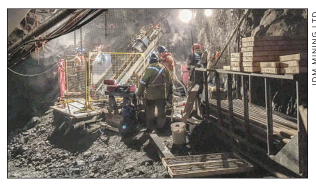
IDM Mining's 2018 drill program cut 1.74 meters averaging 277 g/t gold and 1,442 g/t silver in the newly discovered Lacasse zone at Red Mountain.

Most holes drilled in the AV, JW and Smit zones last year targeted the expansion of known mineralization and the