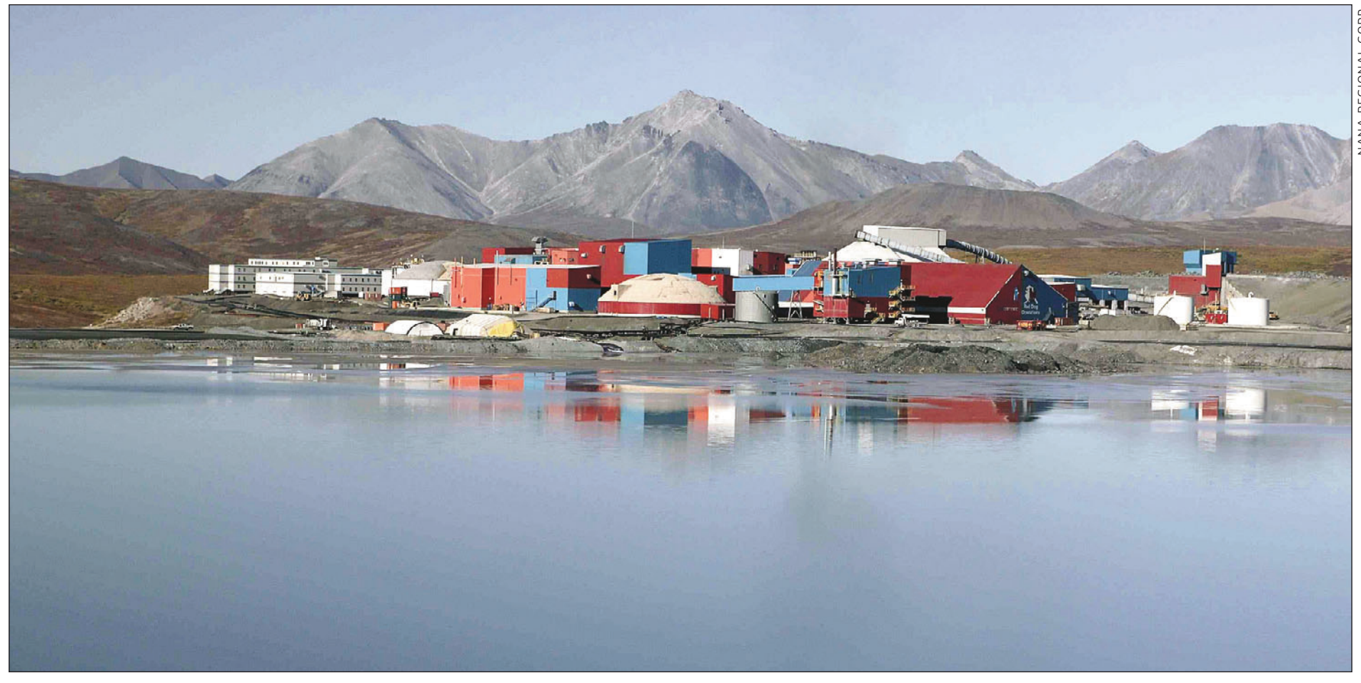
Red Dog, which accounts for roughly 5 percent of the global zinc mine production, is located on lands owned by NANA Regional Corp., the regional Alaska Native corporation Northwest Arctic.