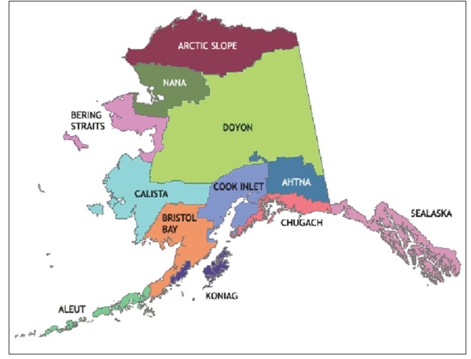
ANCSA involved a unique plan to create 12 Alaska Native regional corporations, with each having its own geographical area of the state based largely on heritage and shared interests.

Eligible Alaska Natives had the opportunity to be issued shares in both a regional and village corporation at the time ANCSA was formed, shares that cannot be sold.