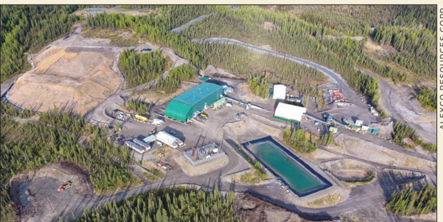
An aerial view of the mill facilities at Keno Hill, which Alexco Resources operated from 2011 until 2013, when the company chose to suspend operations due to weak silver prices. Alexco is now gearing up to resume operations at this high-grade silver project in the Yukon.