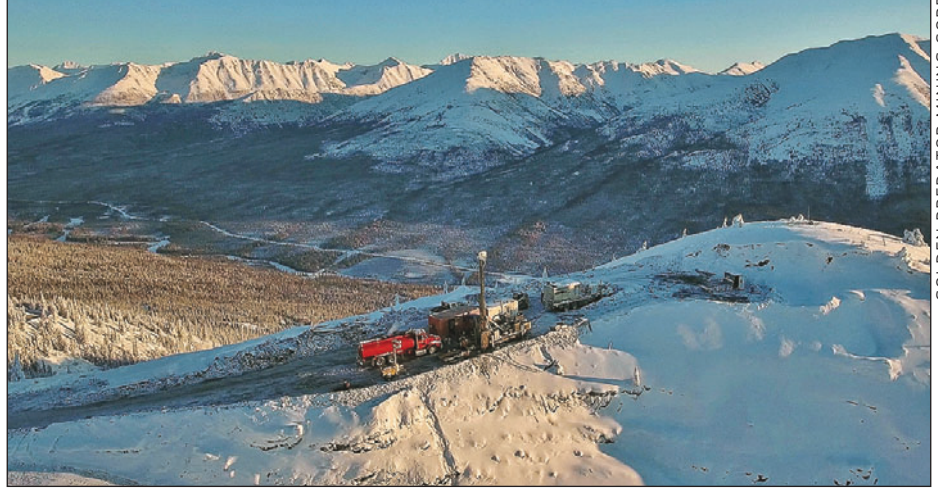
The winter 2016-17 drill program at 3 Aces confirmed high-grade gold mineralization at Ace of Hearts, one of several veins discovered in the central core area of this road-accessible project in southeastern Yukon.

3A 18-153 cut 23.67 meters of 1.06 g/t gold from a depth of 272.65 meters, including 1.13 meters of 13.05 g/t gold.